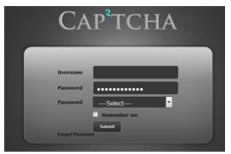
Figure 2: Public Private Captcha login

During the study of CAPTCHA, we have done following observations which we have initiated in our current project. Our proposal is to introduce one private attribute in CAPTCHA, to make it Public-Private key based validation. The CA[P]TCHA changes to CA[PP]TCHA and here P for Public is replaced with PP for Public Private.